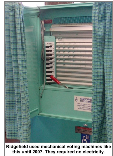
Ridgefield used mechanical voting machines like this until 2007. They required no electricity.