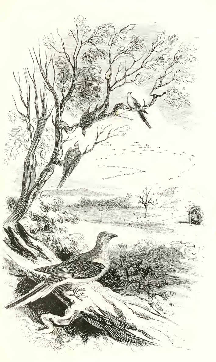
CATCHING PIGEONS. Vol. 1, p. 100