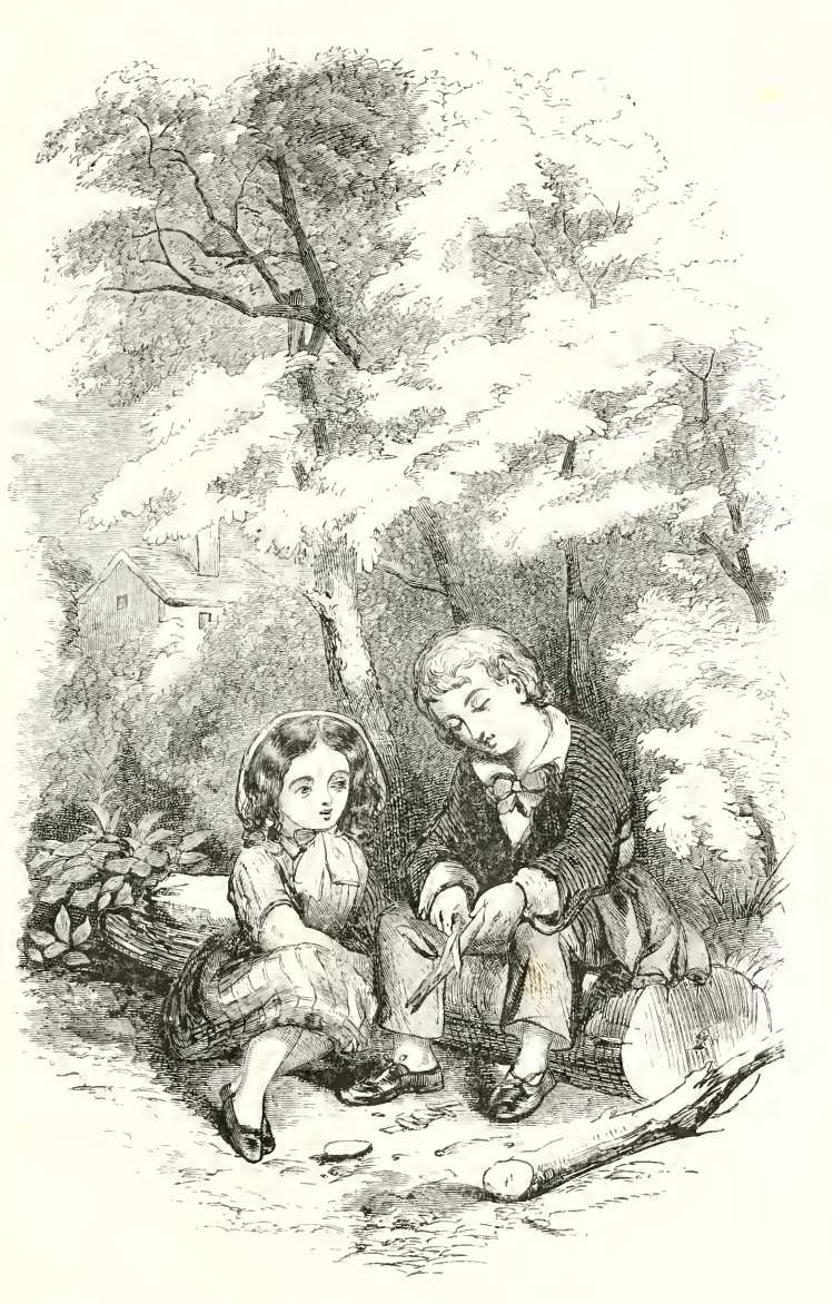
WHITTLING. Vol. 1, p. 94