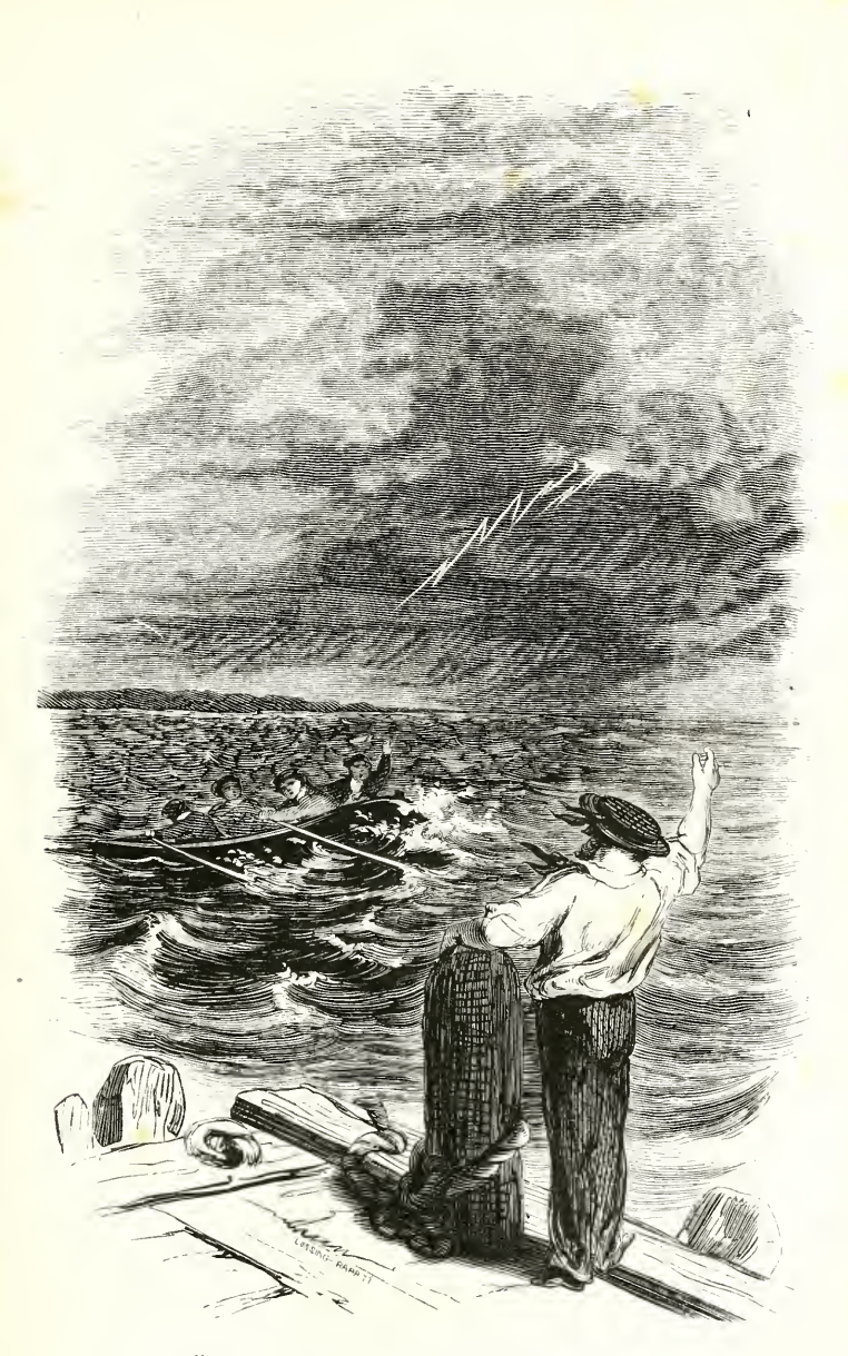
FIRST ADVENTURE UPON THE SEA. Vol 1, p. 342.