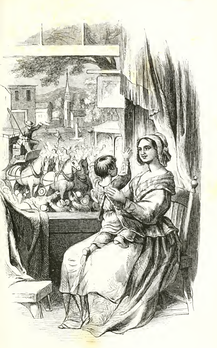
* PEACE ! " * PEACE ! " Vol. 1, p. 505